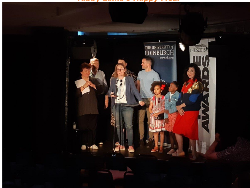
( The Last Return at the awards ceremony)