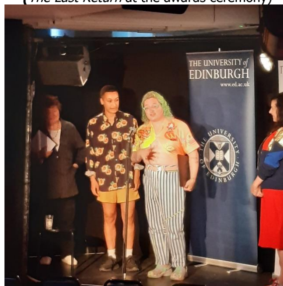
( Happy Meal at the awards ceremony)